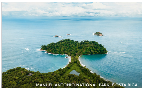
MANUEL ANTONIO NATIONAL PARK, COSTA RICA

From historic San Juan to yacht-only islands like Jost Van Dyke and St. Barts, there's no shortage of sandy spots where our yachts can take you. Along the way, we'll treat you to our Signature Onboard Barbecue and our complimentary Signature Beach Party, the perfect day for fun in the sun at a nearly private beach.