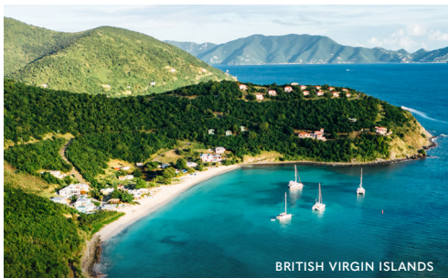
BRITISH VIRGIN ISLANDS

Whether you're unwinding in an overwater bungalow or watching a fire dance on a private island, our nearly 40 years sailing in Tahiti help us bring you closer to the people and places that make French Polynesia legendary — now with your choice of all-suite or sailing yacht.