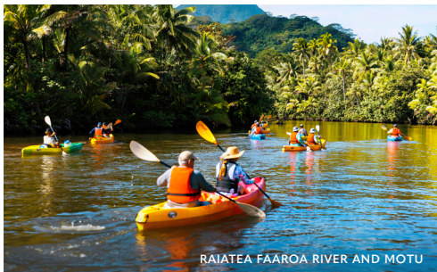
RAIATEA FAAROA RIVER AND MOTU

Into epic history and panoramic views? The fjords and storybook castles of northern Europe are sure to pull on your heartstrings — with legendary landscapes and cultures only our yachts can bring you closer to.